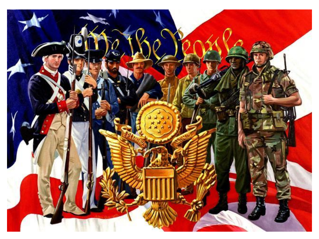
DEFENDERS OF THE U.S. CONSTITUTION