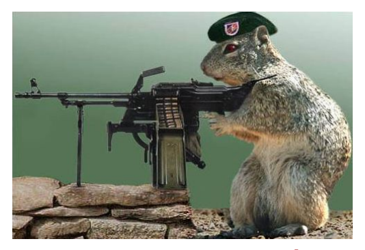
EVER VIGILANT 24/7