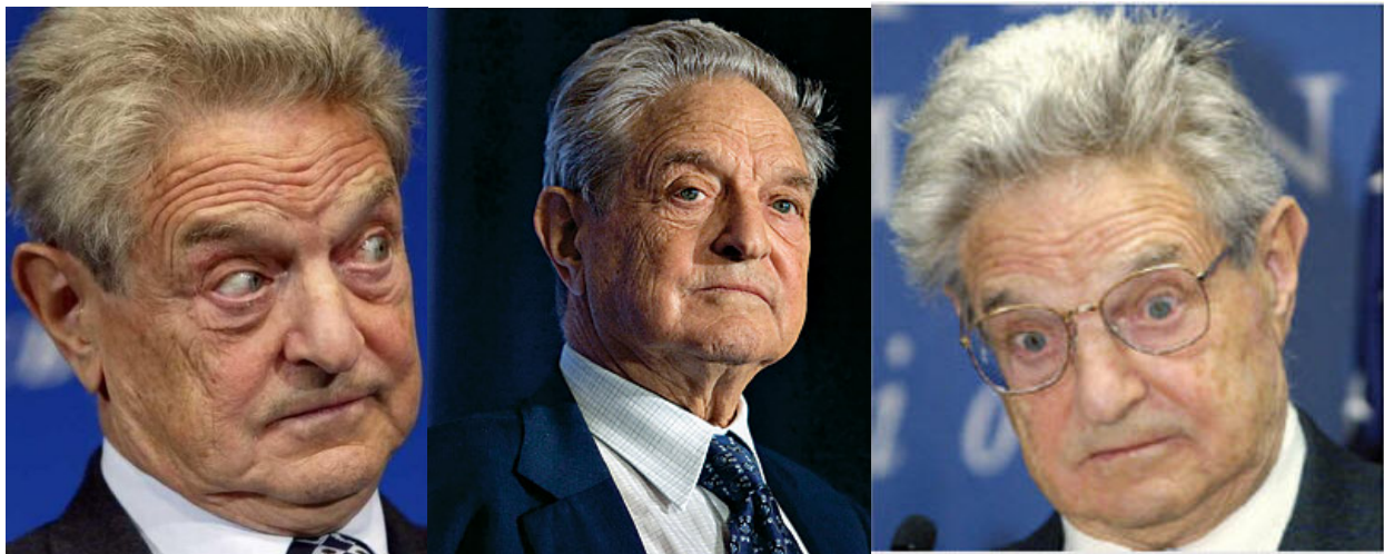
Financial TERRORIST George Soros

This latest confusion spreading through the U.S. Government dovetails directly to the recent meltdown and collapse in U.S. equity, financial foreign currency and precious metal markets across the world.