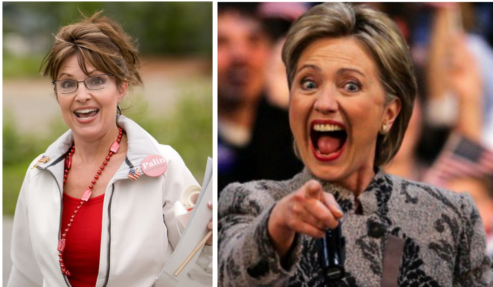
Sarah Parlin (L) and Hillary Clinton

P.P.S. Isn't it interesting that the corporate-controlled, fascist, extortion friendly U.S. media played up both Sarah Palin and U.S. Secretary of State, dysfunctional Hillary Rodenhurst Clinton, on their talk shows this weekend.