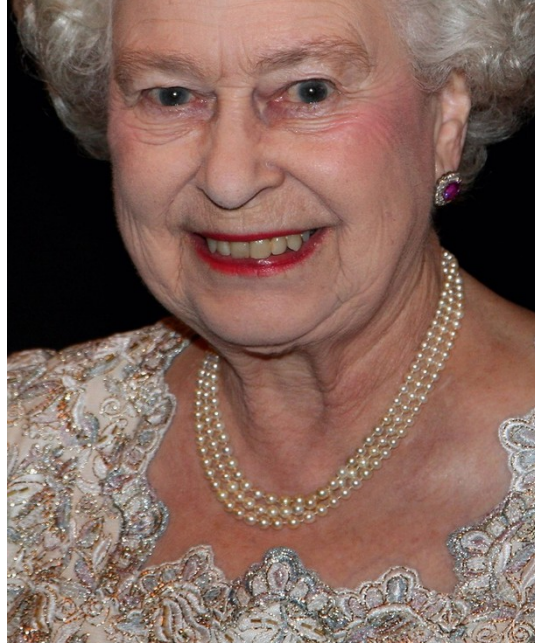
British Monarchy Queen Elizabeth

Soros has been in charge of trading programs tied to the British Monarchy so one must assume that her Majesty, the Queen, does not mind wrecking the European Union and countries like Italy, Spain, Luxembourg and Ireland, since in her own delusional mind, wrecking these nations may some how revive the British nation.