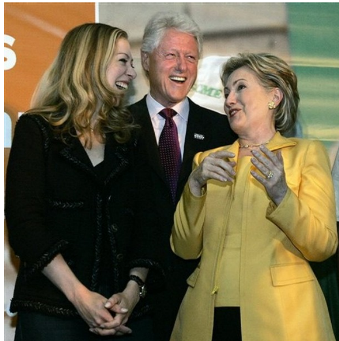
Conspiratorial Clintons: Chelsea, Bill and Hillary