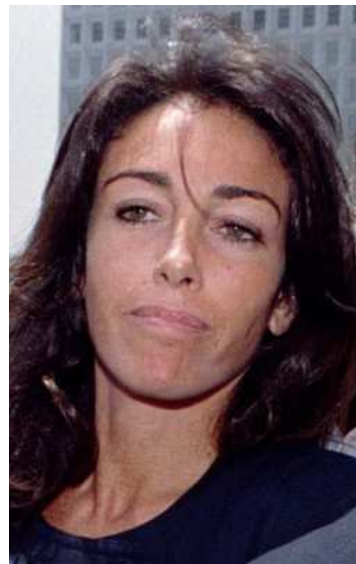
Escort service Madams Deborah Jeane Palfrey (L), Heidi Fleiss