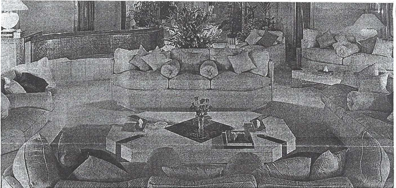
The vast, luxurious main salon with its cozy atmosphere and the intimacy of its decor.

Last night, guests from multinational corporations, hotel-related companies and real estate developers were invited to dinner on board the vessel.