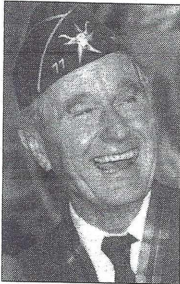
GEORGE BUSH ... Suckers!