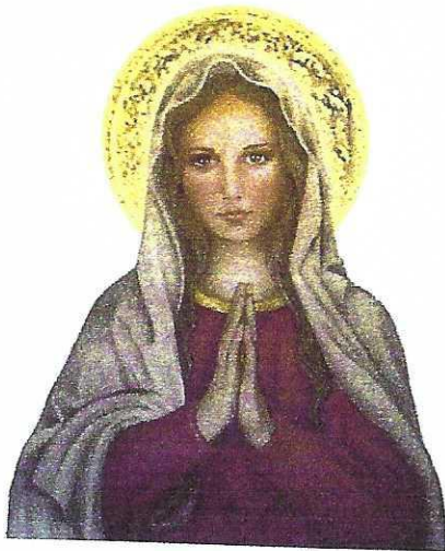
Our Blessed Mother, QUEEN OF PEACE

Also, Our Southern Border Wall Operations