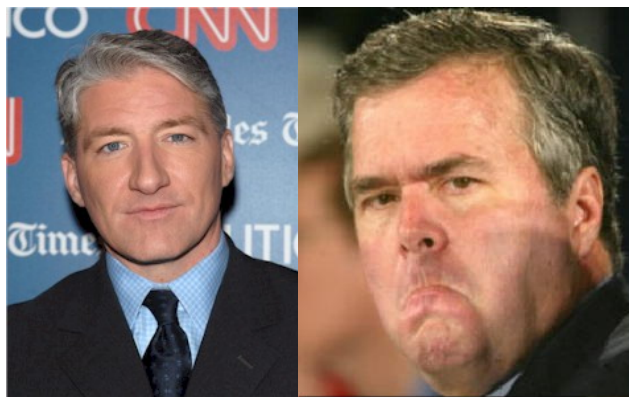
CNN's John King (L), and Bush-Clinton Crime Family Syndicate's Jeb Bush

They are sociopaths, criminals, sexual predators and TRAITORS.