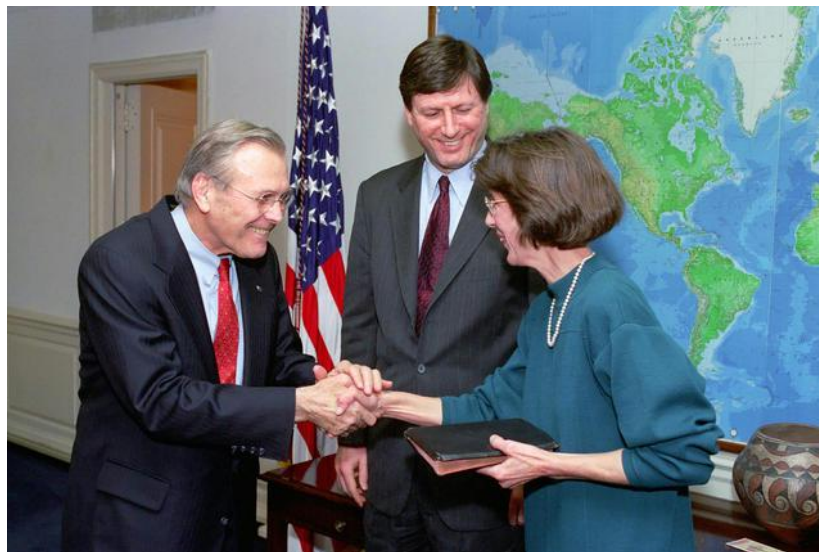
9/11 Co-conspirators Steven Cambone (center) and Donald Rumsfeld (L) Nazi Bush-Clinton Criminal Cabal