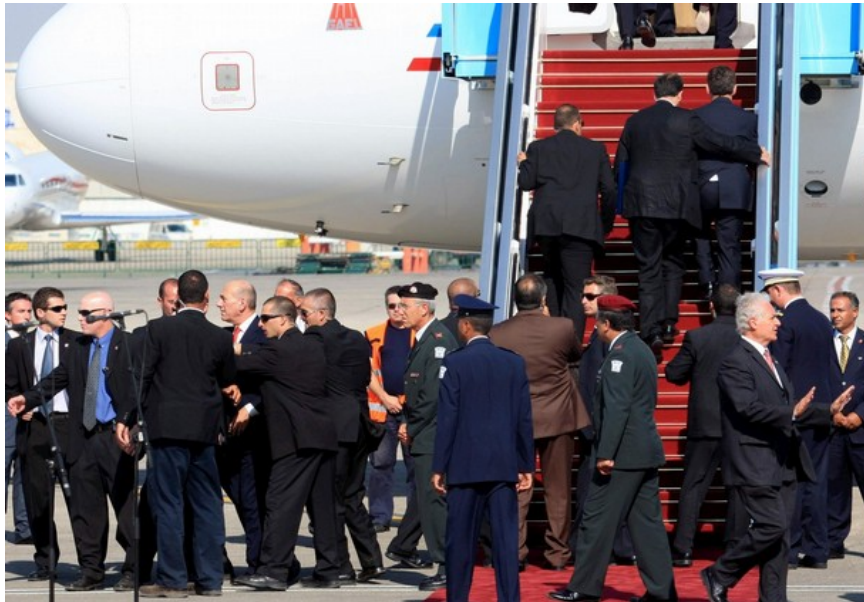
French President Nicolas Sarkozy (r) is escorted up the red carpeted stairs of his plane by bodyguards as Israeli Prime Minister Ehud Olmert is surrounded by his security on the tarmac at Sarkozy's leaving ceremony near Tel Aviv on June 24, 2008

http://cache.daylife.com/imageserve/07iLfRg3qeOA/610x.jpg http://cache.daylife.com/imageserve/0fjv1aY1uR5FW/340x.jpg