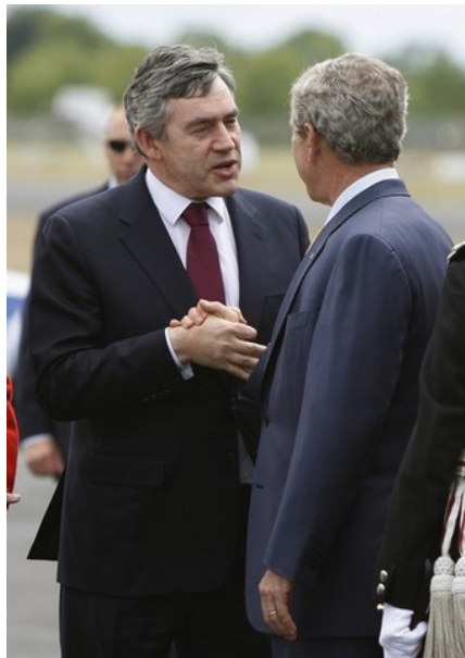
Bushfraud (r) is greeted by British Prime Minister Gordon Brown in Northern Ireland, June 16, 2008.

P. S. The assassination of the French Intelligence Officers happened to coincide just after the recent meetings that took place in Northern Ireland between White House resident George W. Bushfraud, daddy Bush's little bitch Bill Clinton and current British Prime Minister Gordon Brown.