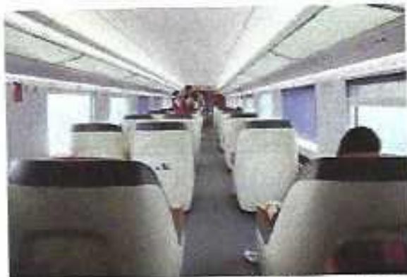
Inside a Chinese High Speed Rail Passenger Car.