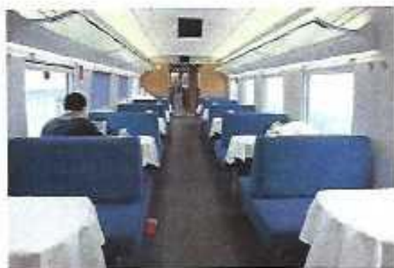
Inside the Dining Car of the Chinese High Speed Rail System.

Central to the Wanta Reconstructing-America Plan (WRAP) is the construction of a true trans-national High Speed Rail System (HSR Maglev) with speeds of 200+ MPH. This is not Rapid Transit (RT) which is limited to speeds 125 MPH or less, typically far less. This is a true state of the Bullet Train like they have in Europe and even China; even more advanced and with more redundant safeguards such as selective/intermittent track segment activation. St. Louis will serve as the central hub where manufacturing, logistics, planning, security and maintenance operations are run, which would certainly vitalize an economically ruined city.