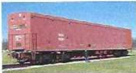
LGM-118 (MX) Peacekeeper Mobile Rail Based Missile System