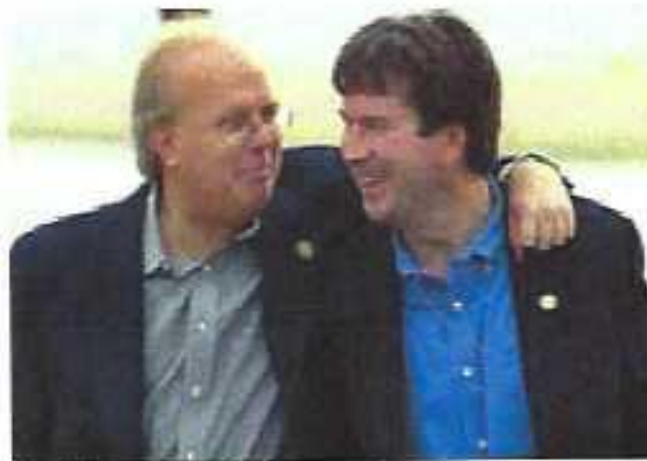
Karl Rove, Brett Kavanaugh