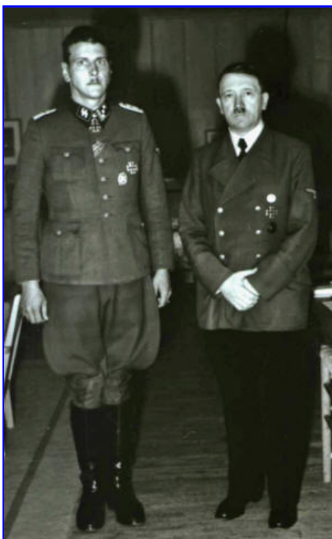
The unmistakable Otto Skorzeny with Adolph Hitler.