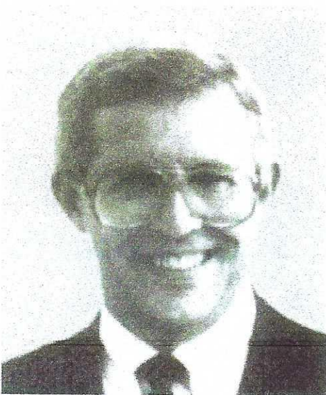
Governor Don Sundquist

Franciscan Mission Associates 276 West Lincoln Avenue, Mount Vernon, N.Y. 10551 Dear Mission Benefactor, Please accept the enclosed gift in sincere appreciation for your most generous donation to our Franciscan Missions. It is through the generosity of people like yourself that we are able to continue our work. If by chance your gift has been damaged in shipment, please return it to us and we will send you a new one. Gratefully yours, Franciscan Friars Franciscan Mission Associates