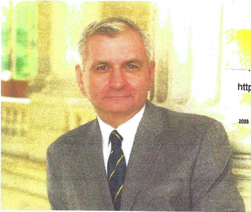
Senator Sheldon Songstad

https://vimeo.com/358555549 https://vimeo.com/370672952 http://eagleonetowanta.com