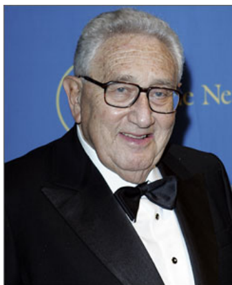
Neocon Henry Kissinger