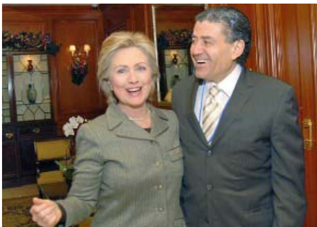
Bushfraud and Baker

http://i.realone.com/assets/rn/img/1/0/5/6/12746501-12746503-large.jpg