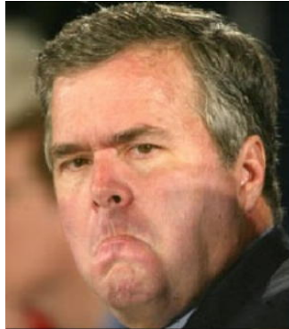
Bushfraud's brother and the year 2000 Florida Governor Jeb Bush

Note: Buchanan conspired with Karl Rove and then Florida Secretary of State Katherine Harris to create the butterfly ballots in the year 2000 Presidential Election in Florida, which stole 20,000 votes from then Vice President, now duly elected President Albert Gore Jr.