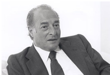
Convicted Felon Irving Lewis “Scooter” Libby

http://www.marcrich.ch/images/title/p_marcrich.jpg