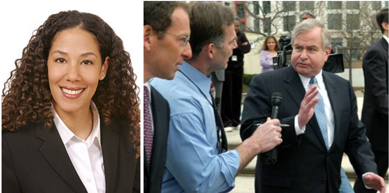
Obama's designated Deputy Chief of Staff Mona Sutphen (L), and her business partner TRAITOR Sandy Berger ®