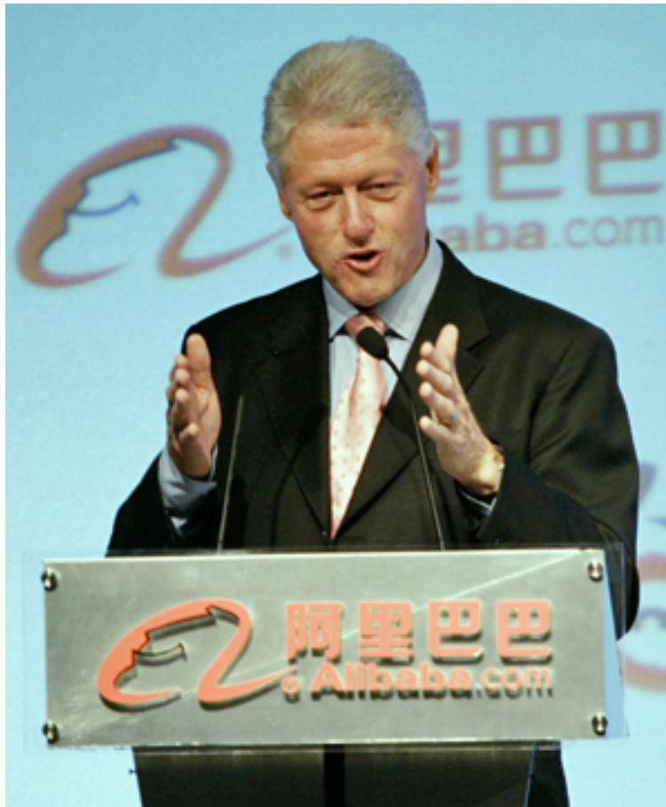
Bill Clinton in keynote address at 2005 conference organized by Alibaba in Hangzhou, China.