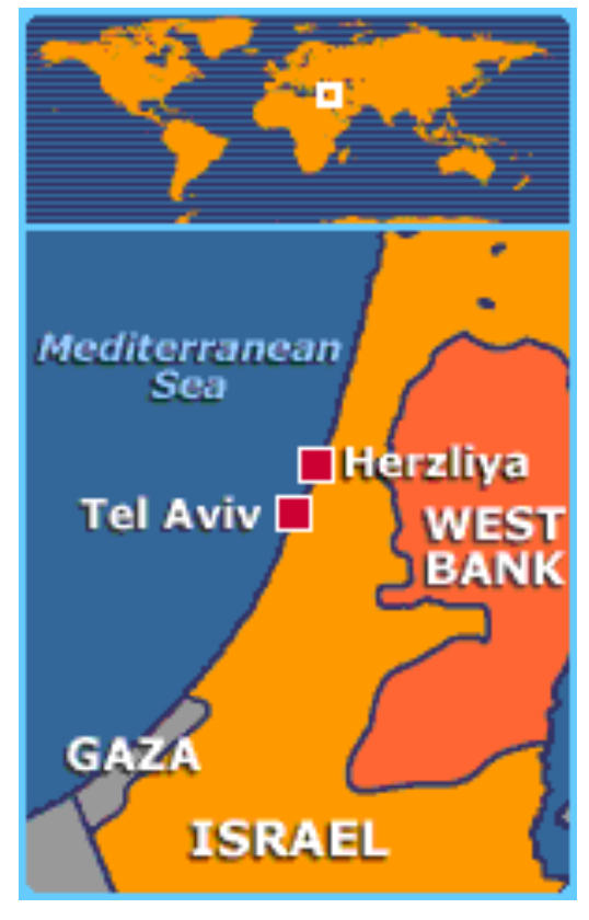
http://news.bbc.co.uk/media/images/38070000/gif/ 38070717 israel herzliya 150map.gif

Independent sources close to the recount have told the Associated Press that the memory cards were quickly taken to Massachusetts and then flown to none other than ISRAEL.