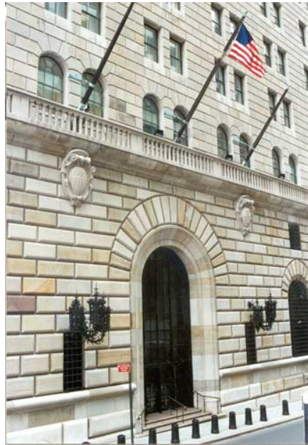
Federal Reserve Bank of New York