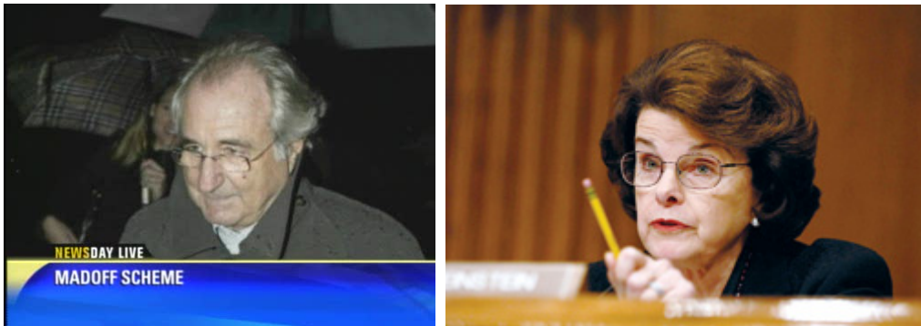
KHAZARIAN Jews: Ponzi scheme artist Bernard Madoff (left), and TRAITOR Senator Dianne Feinstein