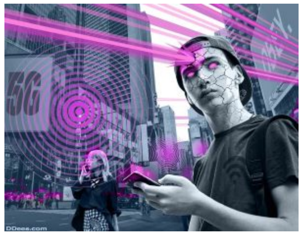
Toxic graphene oxide seems designed to hook the population up to 5G

The real bioweapon is not any 'virus,' but is the 'vaccine' delivery system itself, along with masks, and testing, as perpetrated by the very entity (government) claiming to be your savior. The elimination of this government is in order.