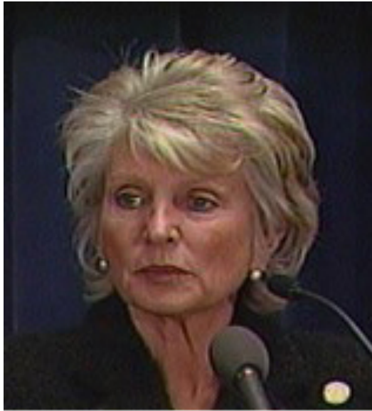
Rep. Jane Harman (D-CA)