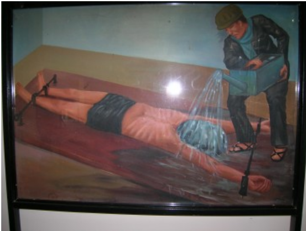
Depiction of waterboarding TORTURE used by the Cambodian Khmer Rouge regime