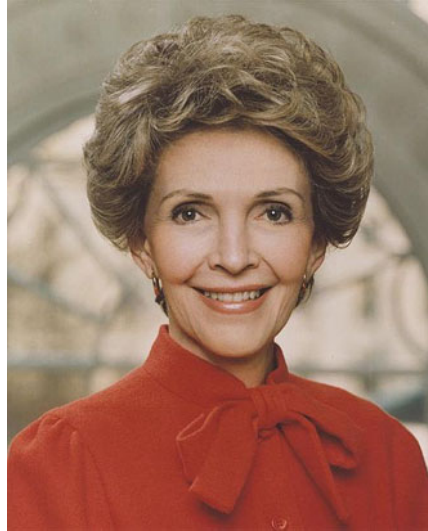
Former First Lady Nancy Reagan President Barack Obama

Reference: Former First Lady Nancy Reagan was on the phone with President Obama this morning while Obama is, once again, vacationing in Hawaii.