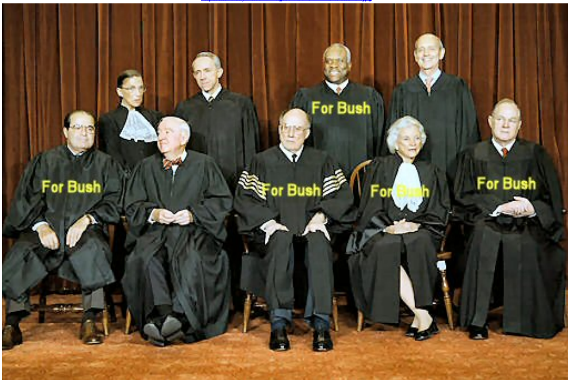
HIGH TREASON TRAITORS GANG OF FIVE COMPROMISED Judges on the U.S. Supreme Court

http://cache.daylife.com/imageserve/0fGV1DYaNtfcc/340x.jpg