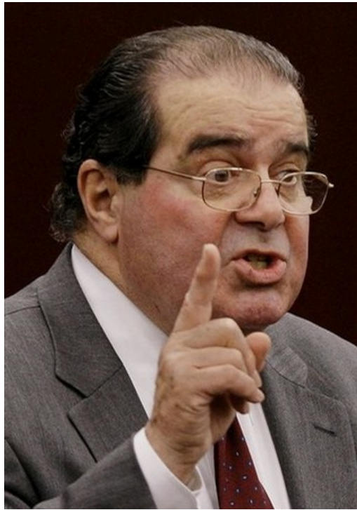
HIGH TREASON TRAITOR CORRUPT U.S. Supreme Court Justice FASCIST Antonin Scalia

http://cache.daylife.com/imageserve/0fGV1DYaNtfcc/340x.jpg