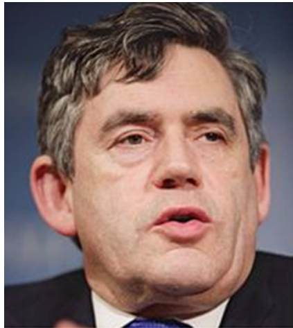
British Prime Minister Gordon Brown