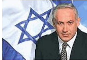
Israeli Prime Minister Ehud Olmert Benjamin Netanyahu