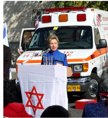
Hillary, AIPAC's darling Clinton speaks at Jerusalem headquarters of Magen David Adom http://clinton.senate.gov/issues/nationalsecurity/israel/MDA_podium.jpg