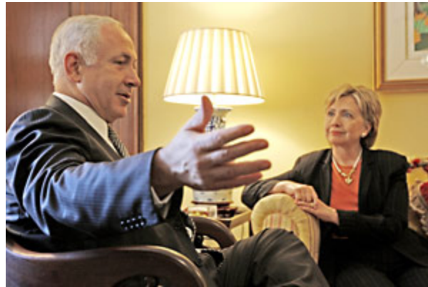
CLOSET lesbian Hillary Clinton with MEGA ZIONIST Benjamin Netanyahu

Both the Bushes and the Clintons are weasels, cowards and TRAITORS! Bill and his unelectable wife, Hillary, just recently held a secret conference with former Israeli Prime Minister Benjamin Netanyahu, along with Israeli tax cheat, Marc Rich's bagman and Univision's Haim Saban.