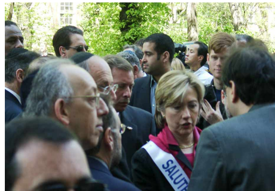
2002 Salute To Israel Parade

http://www.users.cloud9.net/~lipsker/images/hillary_clinton2.jpg http://www.jdc.org/images/news_press_110499a.jpg