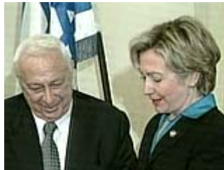
Hillary with Israeli Prime Minister Ariel Sharon, 2005

http://clinton.senate.gov/issues/nationalsecurity/israel/MDA_podium.jpg