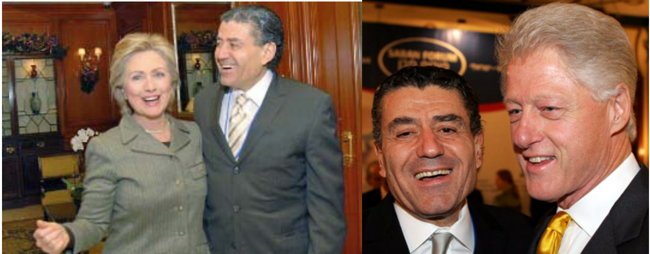
Bill and Hillary Clinton with fugitive Mossad bagman and East German DVD master spy Marc Rich's bagman Israeli Haim Saban

http://www.haaretz.com/hasite/images/iht_daily/D210607/300bibihilary210607_ap.jpg