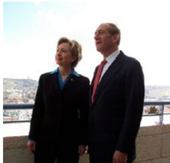
Hillary Clinton with then Jerusalem Mayor and now Israeli Prime Minister Ehud Olmert