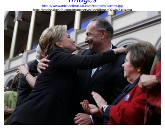
Hillary Rodenhurst Clinton hugs Charles Schumer http://cache.daylife.com/imageserve/02yE738cmkdrV/610x.jpg AP by Susan Walsh