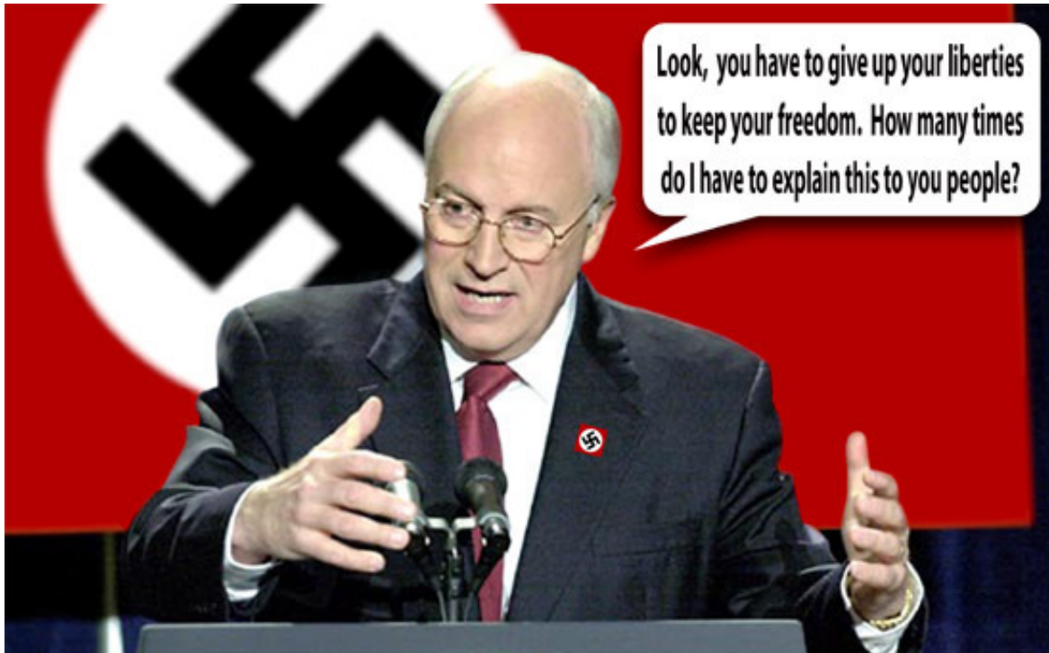
Richard Cheney aka Dick the dick

Plus British MI6 is continuing an investigation of former Prime Minister Tony Blair, former President William Jefferson Clinton and former U.S. Secretary of State Madeleine Albright aka Halfbright, i.e. SECRET banking accounts and transactions in none other than North Korea.