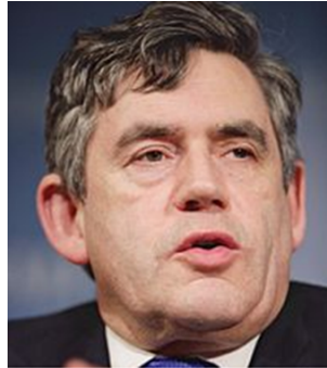
British Prime Minister Gordon Brown