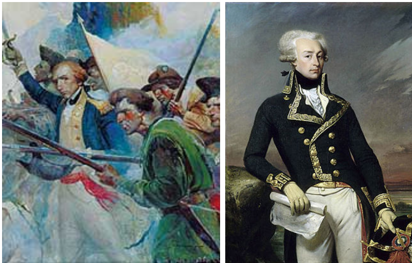
http://www.vahistorical.org/img/publications/lafayette.jpg http://upload.wikimedia.org/wikipedia/commons/thumb/5/52/Gilbert_du_Motier_Marquis_de_Lafayette.jpg/300px-Gilbert_du_Motier_Marquis_de_Lafayette.jpg Brigadier General Lafayette rallying troops at the Battle of Brandywine

"The moment I heard of America, I loved her; the moment I knew she was fighting for freedom, I burned with a desire of bleeding for her." ~ General Gilbert du Motier Lafayette