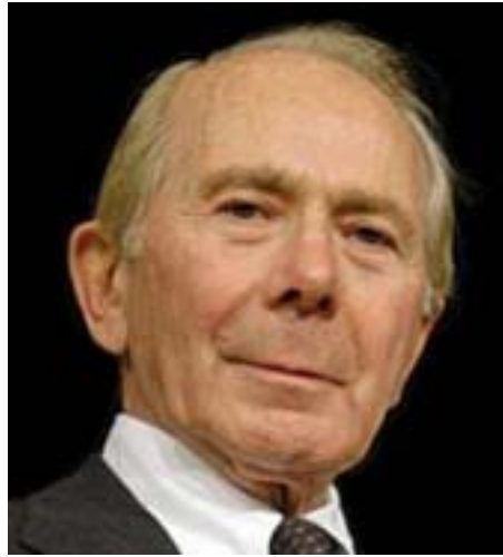
Maurice "Hank" Greenberg

http://thekomisarscoop.com/wp-content/uploads/2007/05/maurice-greenberg.jpg