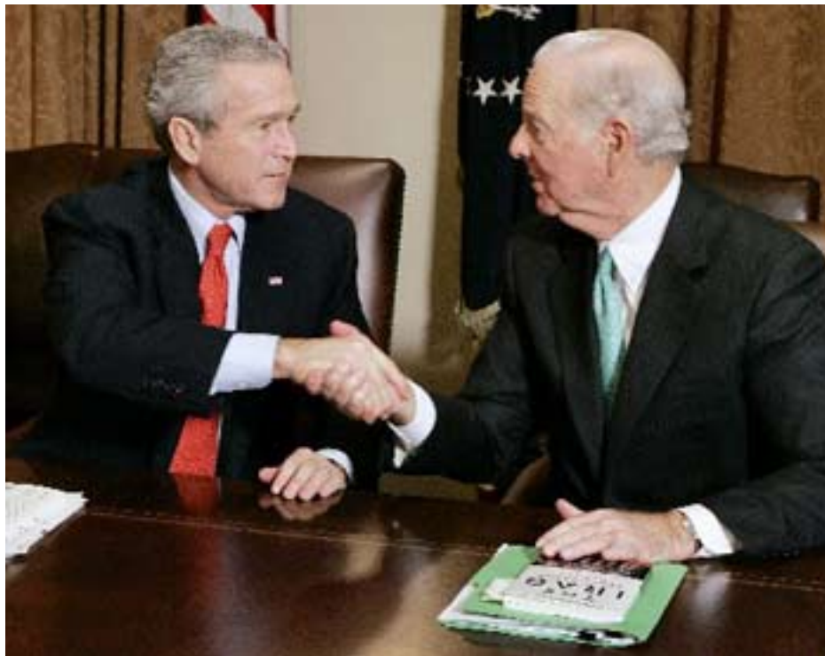
Co-conspirator James Baker and Bushfraud

Involved in the year 2000 presidential election bribes of Florida election officials were Republican stooges James B. Baker, Florida Governor Jeb Bush, slut Katherine Harris, Columbian cartel drug lord Carlos Lehder and his attorney, UNELECTABLE Hillary Rodenhurst Clinton's brother, Hugh Rodham and current Democratic Congresswoman from Miami, Florida, KHARZARIAN Jew Debbie Wasserman Schultz.