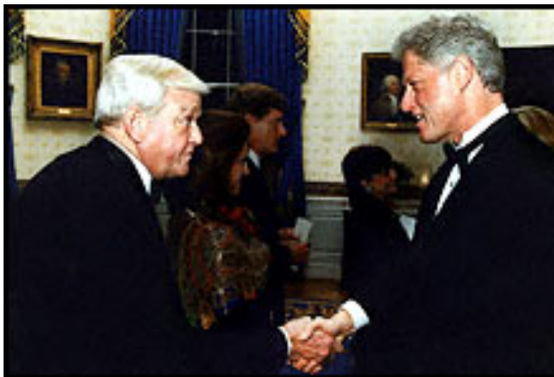
Richard Mellon-Scaife and Bill Clinton

KHARZARIAN Jew Wasserman Schultz also worked with current PRO-Hillary Democratic Governor of Pennsylvania, KHARZARIAN Jew Ed Rendell in soliciting Florida-Gate 2000 BRIBE money from Richard Mellon-Scaife's Mellon Bank of Pennsylvania.