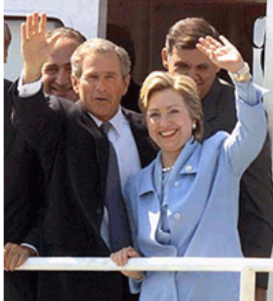
BushFraud and Hillary Clinton

http://www.tribuneindia.com/2001/20010712/2world.gif