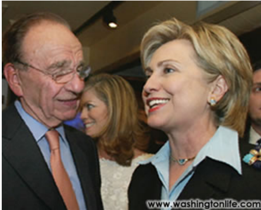
Former Fox News CEO Rupert Murdoch and Hillary Clinton

http://www.washingtonlife.com/issues/june-2006/media_spotlight/images/media_spotlight23.jpg