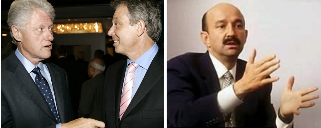
Bill Clinton and Tony Blair (L), Carlos Salinas

Not one dime ever reached the Mexican People and the funds were illegally laundered through Dubai, United Arab Emirates, utilizing the illegal London trading platform administered by Dunblaine pedophile, war criminal and former British Prime Minister Anthony Blair.