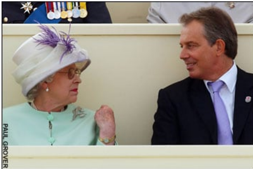
British Monarch Elizabeth with her hand-picked Prime Minister, Dunblaine pedophile and war criminal, Tony Blair

United States of America – It can now be reported that the British Sovereign, Queen Elizabeth II, along with former Prime Minister, Dunblaine pedophile and war criminal, Tony Blair, are now facing arrest should they ever again appear on American soil for money laundry, criminal conspiracy and Misprision of Felonies.