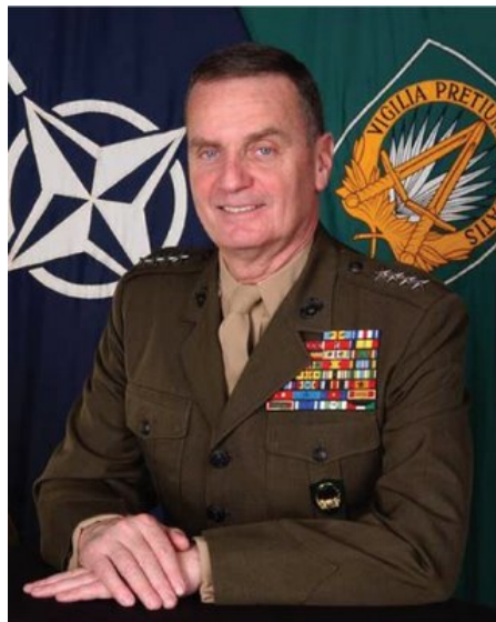
National Security Advisor General James Jones

P.S. At this hour alleged President, CIA asset and Bush-Clinton Crime Family Syndicate stooge, Barack Hussein Obama, aka Barry Soetoro has been told by sociopath, former President George Herbert Walker Bush aka daddy Bush and his White House legal counsel and Bush-Clinton Crime Family Syndicate stooge, "Skull and Bonesman" Greg Craig that Obama no longer has authority as President of the United States.