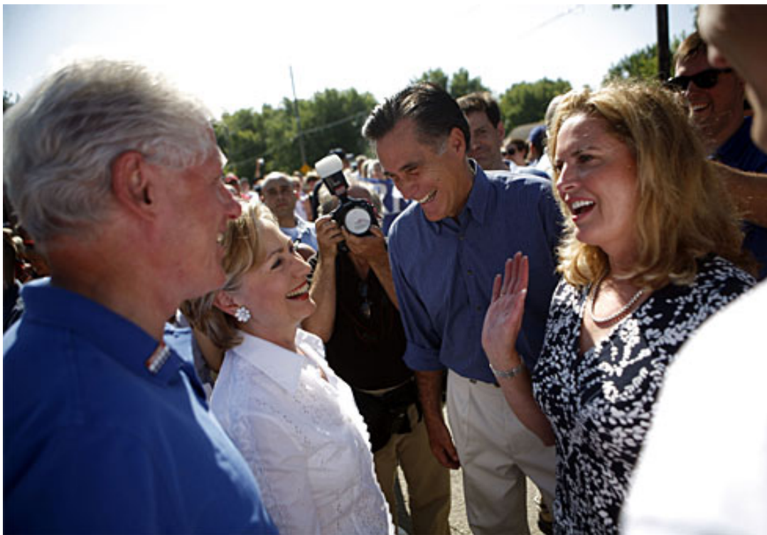
Bush-Clinton Crime Family Syndicate Conspirators Bill and Hillary Clinton and Mitt Romney

to launder TRILLIONS of dollars of STOLEN U.S. Treasury funds tied to the Delmarva Timber Trust that were parked in a secret offshore Cayman Island hedge fund controlled by former Republican presidential candidate Mitt Romney back into the United States to the accounts of the noted terrorist brokerage house J. P. Morgan aka the Queen of England's bank.