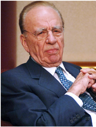
Matt Drudge, Rupert Murdoch Greenberg

which include Bill and Hillary Clinton, George Bush Sr., former Federal Reserve Chairman Alan Greenspan, current Federal Reserve Chairman Bernard Bernanke, former BushFRAUD's U.S. Treasury Henry 'Hank' Paulson, former Secretary of Defense Donald Rumsfeld, former Speaker of the House of Representatives Newt Gingrich, former Federal Reserve Bank of New York CEO Stephen Friedman, TIME magazine columnist and Bush-Clinton Crime Family Syndicate enabler, Joe Klein, Canadian-born owner of the New York Daily News and U.S. News and World Report, Mortimer 'Mort' Zuckerman, internet mogul, homosexual in-the-closet Matt Drudge, and FOX News CEO Rupert Murdoch Greenberg.