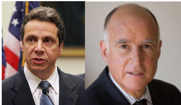
Andrew Cuomo (L) and Edmund G. Brown, Jr.

Item: Patriotic Flag Officers of the U.S. Military are preparing, as we speak, to arrest members of the Bush-Clinton Crime Family Syndicate and demand that the money they have STOLEN and LOOTED from the U.S. Treasury be returned back to American People.