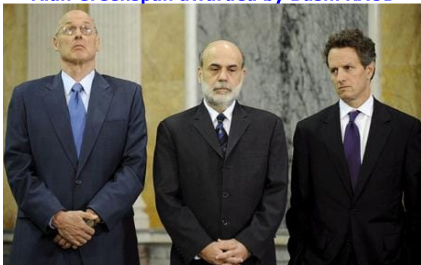
Henry 'Hank' Paulson, Bernard Bernanke and Timothy Geithner