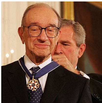
Alan Greenspan awarded by BushFRAUD