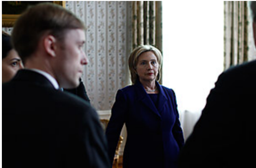
Secretary of State Hillary Clinton