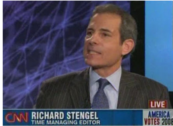
Christopher Cox, Richard Stengel