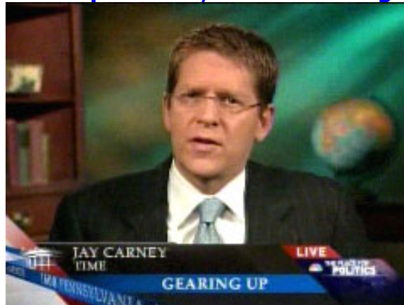
Jay Carney, George Stephanopoulos