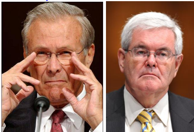
Donald Rumsfeld, Newt Gingrich