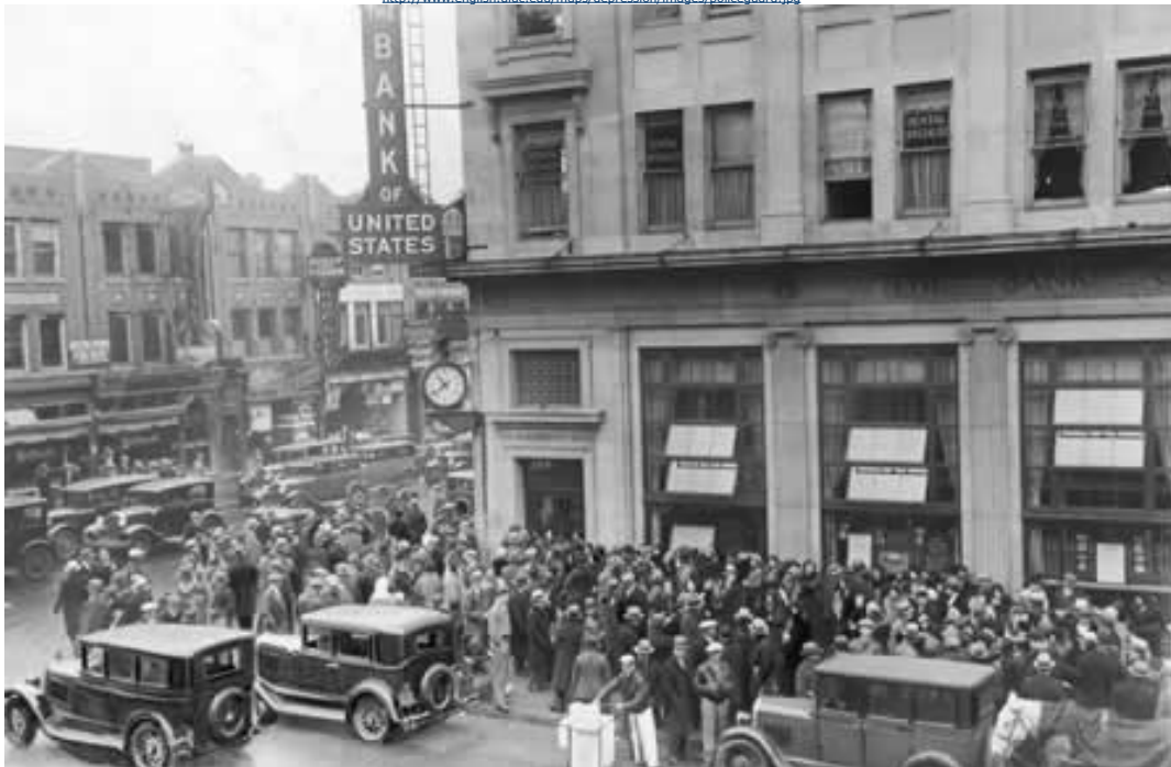
Americans demanding return of their own money

http://www.english.uiuc.edu/maps/depression/images/policeguard.jpg