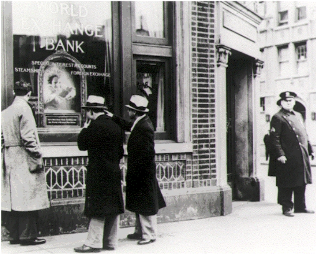
Policeman guards a closed bank

http://www.english.uiuc.edu/maps/depression/images/policeguard.jpg