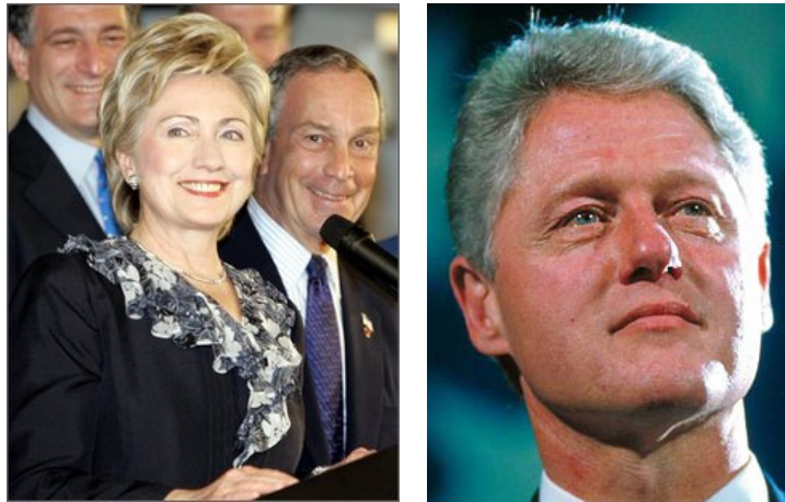
Hillary Clinton, Michael Bloomberg, Bill Clinton

http://images.usatoday.com/Wires2Web/20070622/2994228215_Bloomberg_Clintonx.jpg http://schema-root.org/region/americas/north_america/usa/government/politicians/presidents/bill_clinton/bill_clinton.jpg