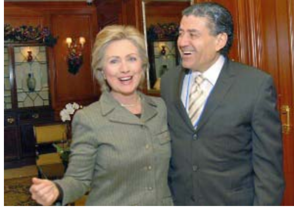
Hillary Clinton with "Israeli First" ZIONIST Haim Saban at the Saban Center's conference on the Middle East, Washington, D.C. on December 10, 2006

Important note: personal friend of recently indicted Bernard Kerik is none other than MOSSAD agent and noted unelectable Hillary Rodenhurst Clinton fundraiser Haim Saban.