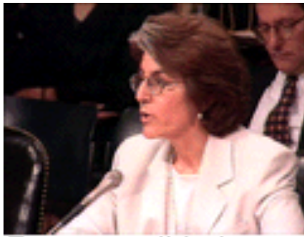
Thomases testifying in August