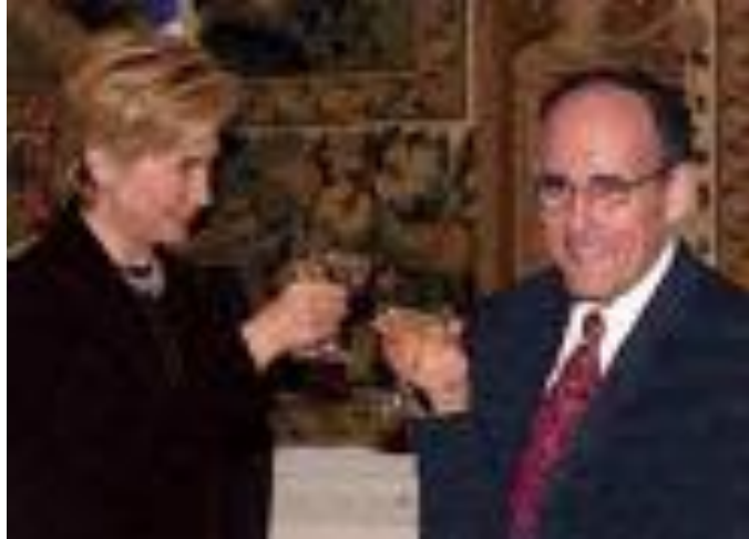
Hillary Clinton with Rudy Giuliani