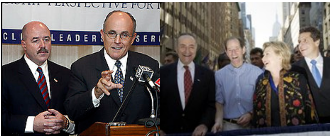
Bernard Kerik, Rudy Giuliani, Charles Schumer, Eliot Spitzer, Hillary Clinton, Andrew Cuomo