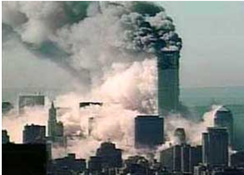
9/11/2001 attack on New York City

And now, of course, it gets a lot worse!