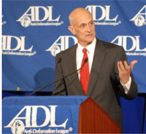
Homeland Security Secretary Michael Chertoff addresses ADL's National Leadership Conference.

Department of Homeland Security Secretary Michael Chertoff contracted the Anti-Defamation League (ADL) to provide its specialized training and expertise on extremism, hate groups, domestic and international terrorism