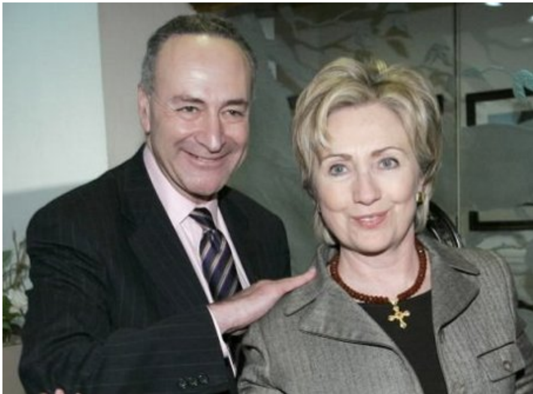
Hillary Rodenhurst Clinton embracing Jon Corzine, Eric Cantor (c), Charles Schumer