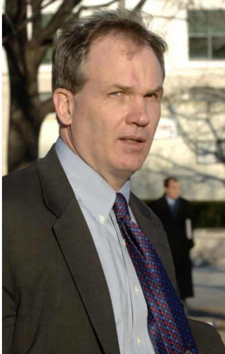
TRAITOR Patrick Fitzgerald

Closet homosexual Patrick Fitzgerald never indicted anyone on the crime he was appointed to investigate aka who leaked CIA covert agent Valerie Plame's name to CIA media journalist Robert Novak.