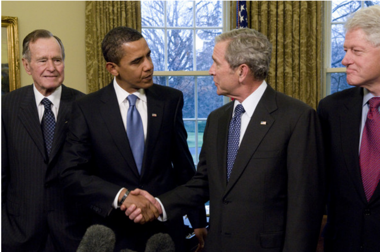
Daddy Bush, Obama puppet, BushFRAUD and daddy Bush's little bitch Bill Clinton

P.P.S. this hour the Bush-Clinton Crime Family Syndicate controlled puppet Obama Administration, along with its White House legal counsel "Skull and Bonesman" stooge Greg Craig, continues a massive cover up involving the illegal rendition flights of alleged Al Qaeda 9/11 terror suspects aka 9/11 patsies who were illegally tortured in order to coerce confessions involving their knowledge of activities relating to 9/11 as to protect and cover up the activities of the 9/11 Israeli spy ring who have now been fingered with FBI tape recorded conversations in orchestrating the 9/11 attacks on the United States.