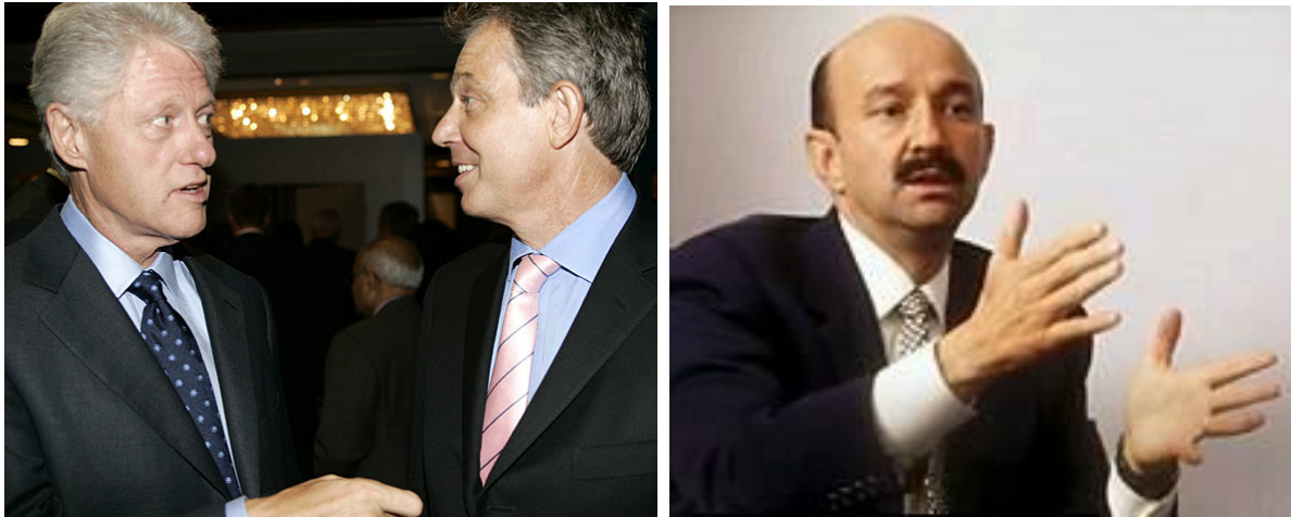
Bill Clinton, Tony Blair, Carlos Salinas

Eric Holder's U.S. Department of Justice has re-opened the President Bill Clinton 1993 loan that was made to Mexican President Carlos Salinas.